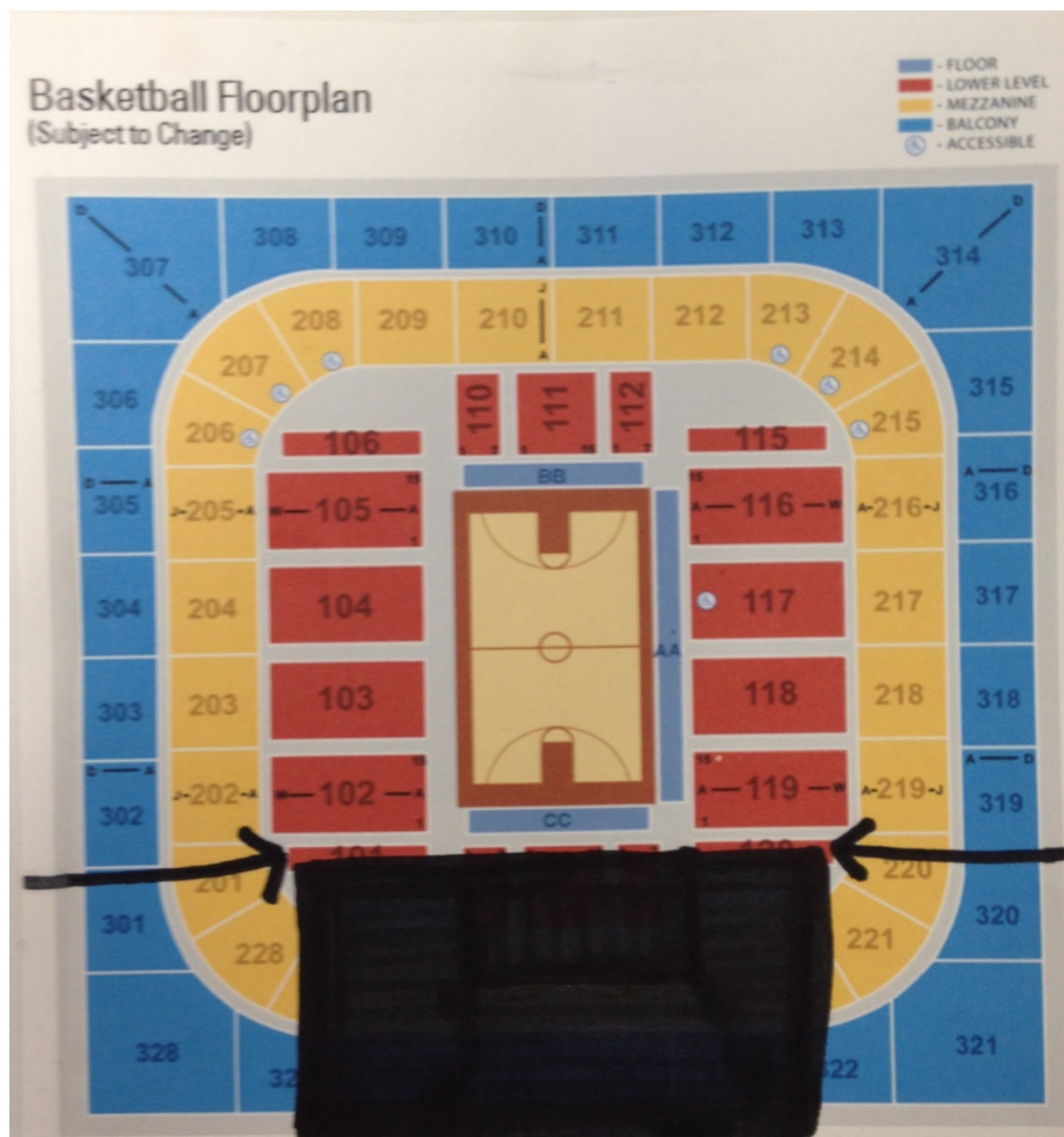
Curtained Area (limited view)

Coaches who will arrive by car will need to park in the parking garage or along the street. There is a fee for the parking garage.